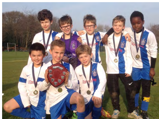
U9 Football- Forest Tournament Plate Winners (See Tournament Reports below)